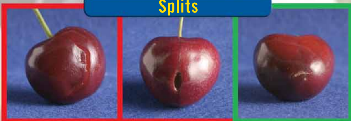
08 Major Wet Split