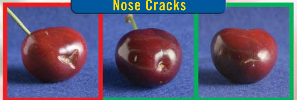
11 Major Nose Crack