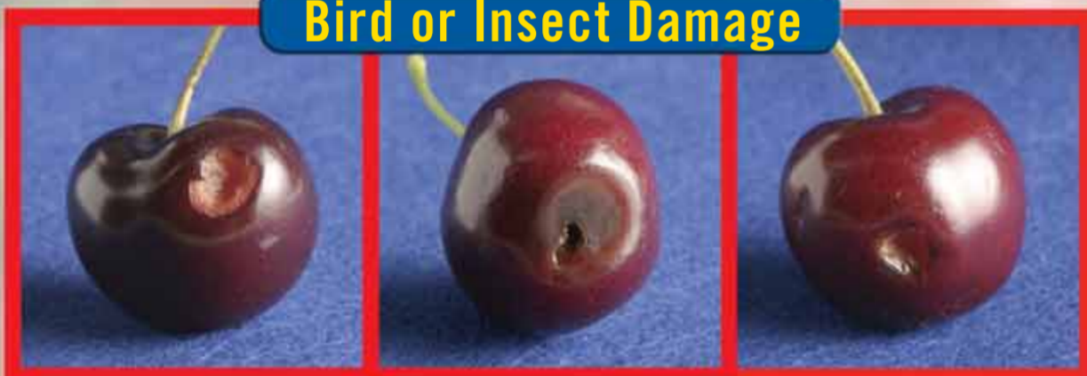
14 Major Insect Damage