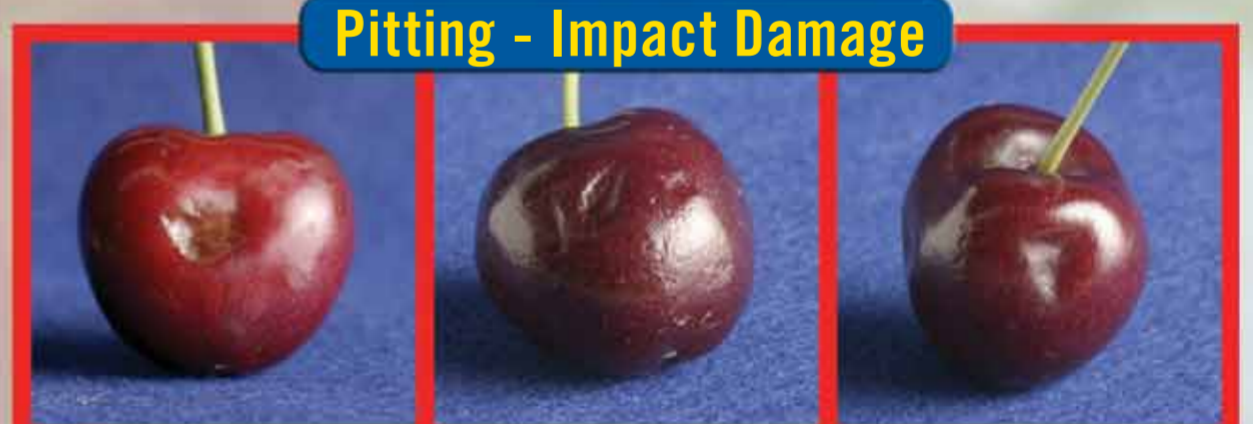
23 Major Pitting