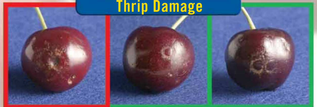
17 Major Thrip