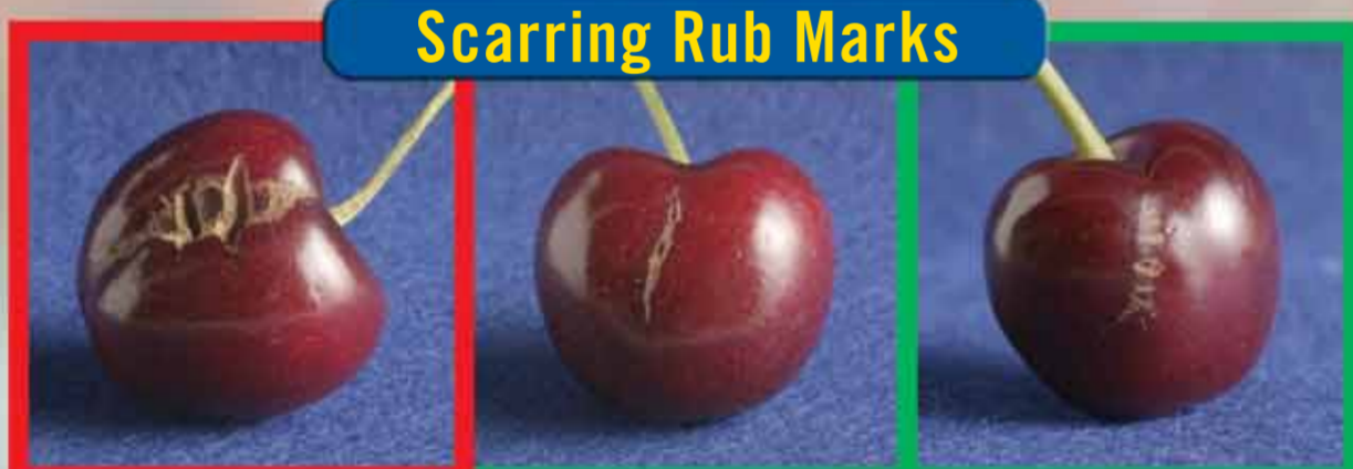
20 Major Scarring