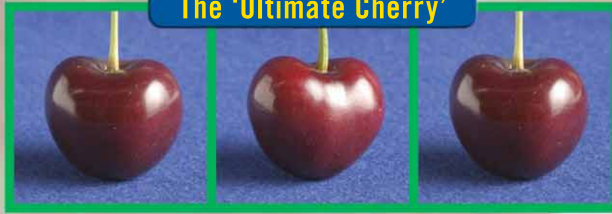
01 'Ultimate Cherry'