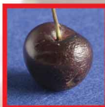
30 Overmature and Heat Damage