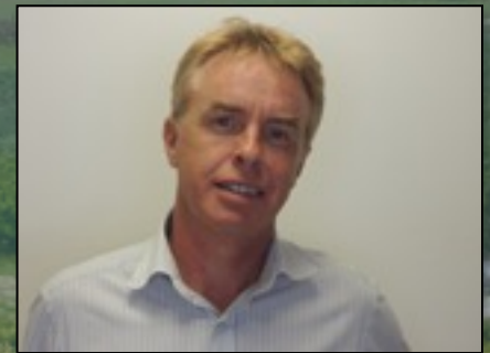
Dr Nicola Dalla Betta - international expert in temperate tree crops

16 - 18 June 2016 C3 Convention Centre South Hobart Huon Valley