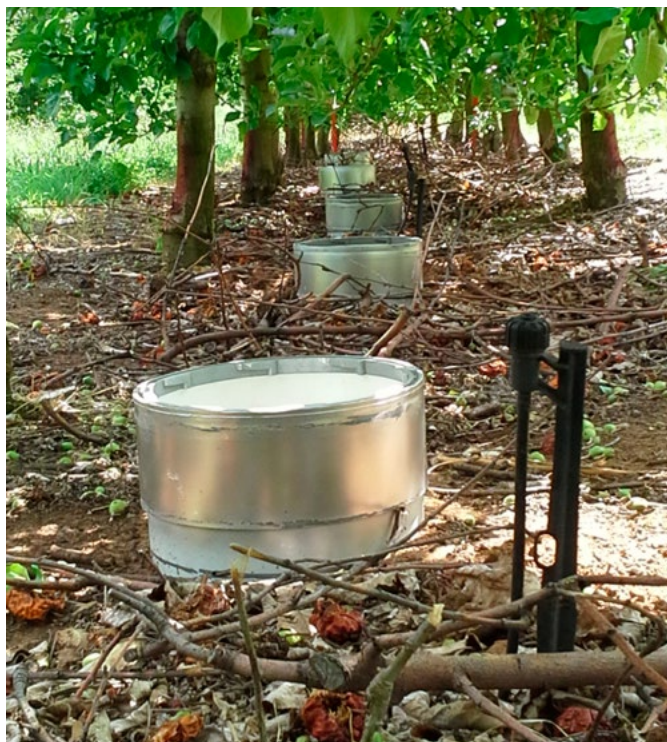
Chambers used to measure nitrous oxide emissions from the soil in apple/cherry orchards.

Fertigation also helps to lower further the risk of nitrous oxide emissions. By multiple split nitrogen fertiliser applications, which are only practical with the use of fertigation, nitrogen supply can be closely matched to the nitrogen requirement of the trees. As a result, mineral nitrogen does not build up in the soil. And without lots of nitrate, nitrous oxide emissions will be low.