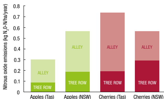
Figure 1: Annual nitrous oxide emissions from the soil of apple and cherry orchards in Tasmania and NSW

In a great result for the orchards, the annual soil nitrous oxide emissions were a very low at 0.3 to 0.7 kg N 2 O-N ha -1 year -1 (Figure 1). These low emissions were achieved with nitrogen fertiliser rates ranging from 15 to 200 kg N ha -1 , giving the apple and cherry industry something to smile about.